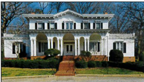
40+ Statewide Preservation Easements