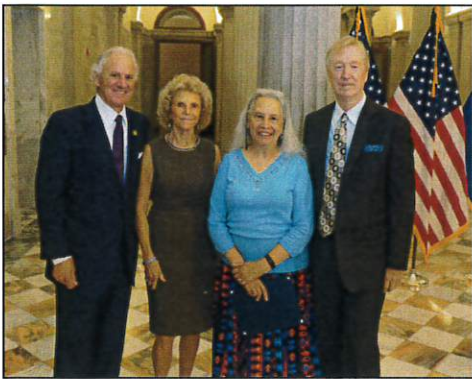
Statewide Preservation Awards

We are working with town leadership to re-purpose this historic building that is within the downtown community.